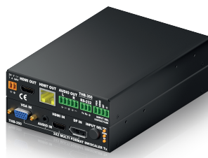
HDBT Tx, P/N 74-040-01, model THB-350