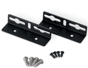
Under desk mount, P/N 78-002-01