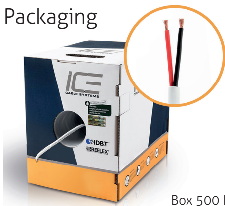
Box 500 Ft.