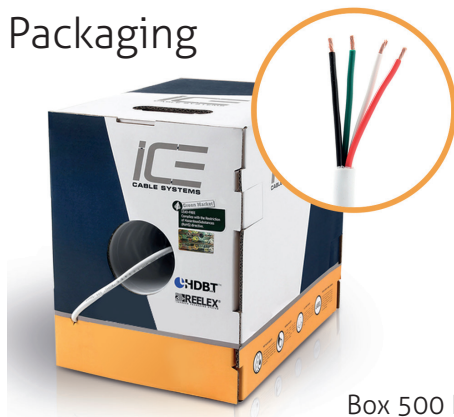
Box 500 Ft.